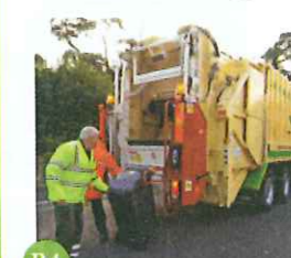
P.4 Christmas waste collections