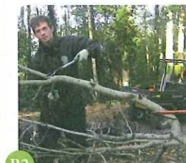
P.2 Keeping us green