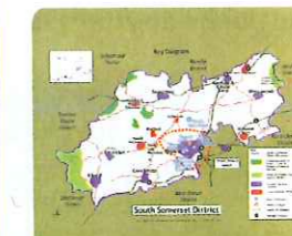
P.2 Core Strategy