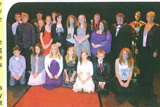
Photo shows the winners of this year's Gold Star Awards organised by our Community Health and Leisure team in recognition of local volunteers' work with young people, using our Octagon Theatre as the venue.

There is a small grants budget available for community projects in Chard, Crewkerne and Ilminster area and we welcome applications for local projects such as (continued on page 3)