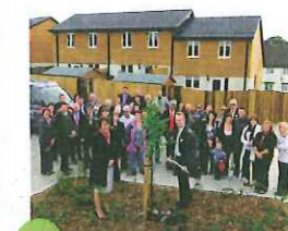
P.3 Affordable homes